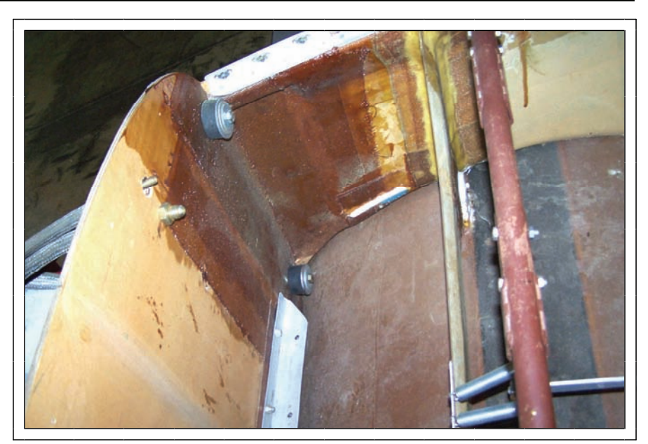
(Continued on page 9)

Vibration reduction and simplification? Some of the engines we like to use on airplanes need a good vibration reduction system but that is sometimes difficult because of the odd, and sometimes, uneven attachment points that have to be used at the engine. With this in mind and since most airplanes have a uniform flat firewall we designed a motor mount system that would have large Barry rubber mounts going through the firewall. We originally tried this design on our Glasair with a Turbocharged Mazda RX-7 engine with great success. We choose to use this same design