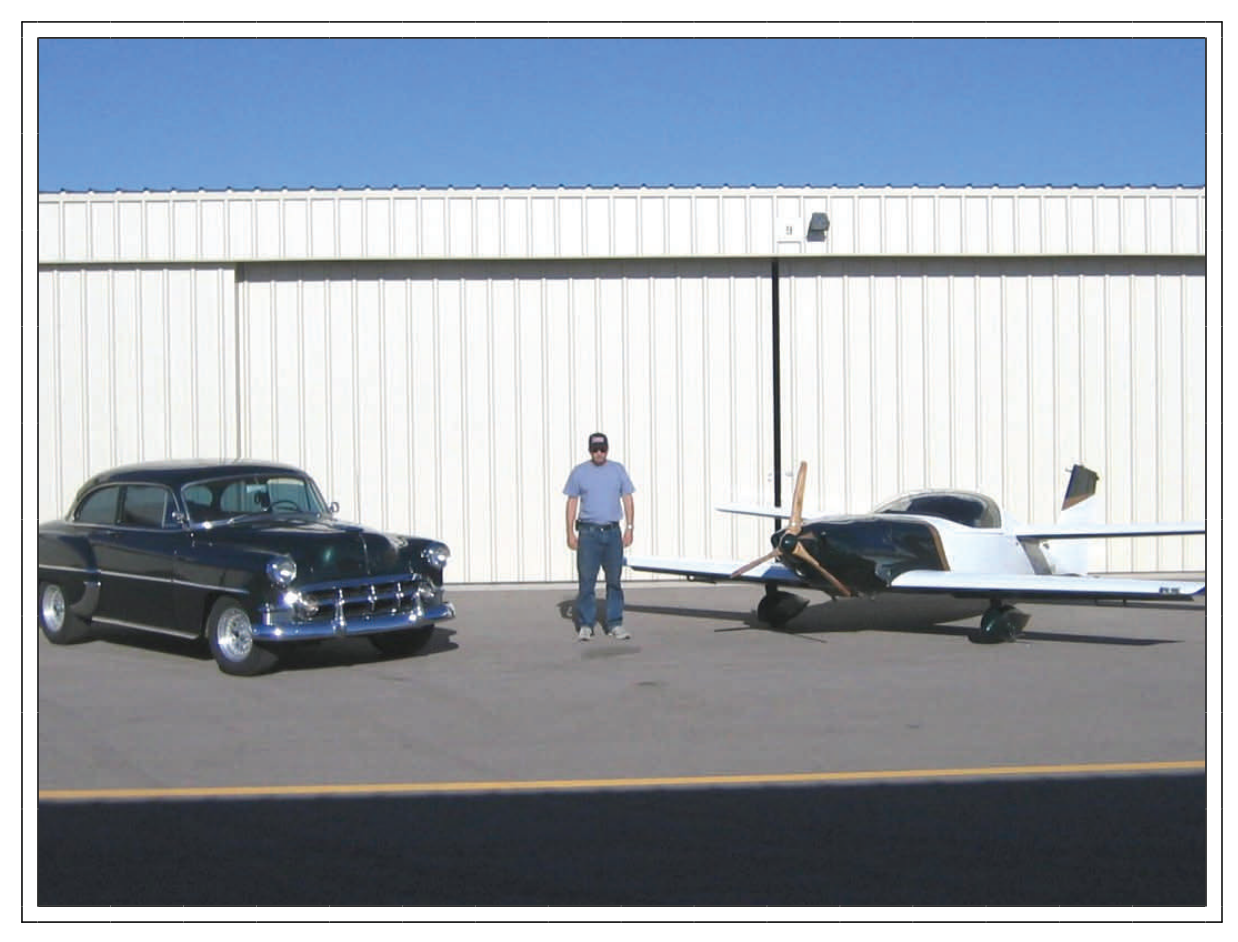
DBFN 119 PAGE 3