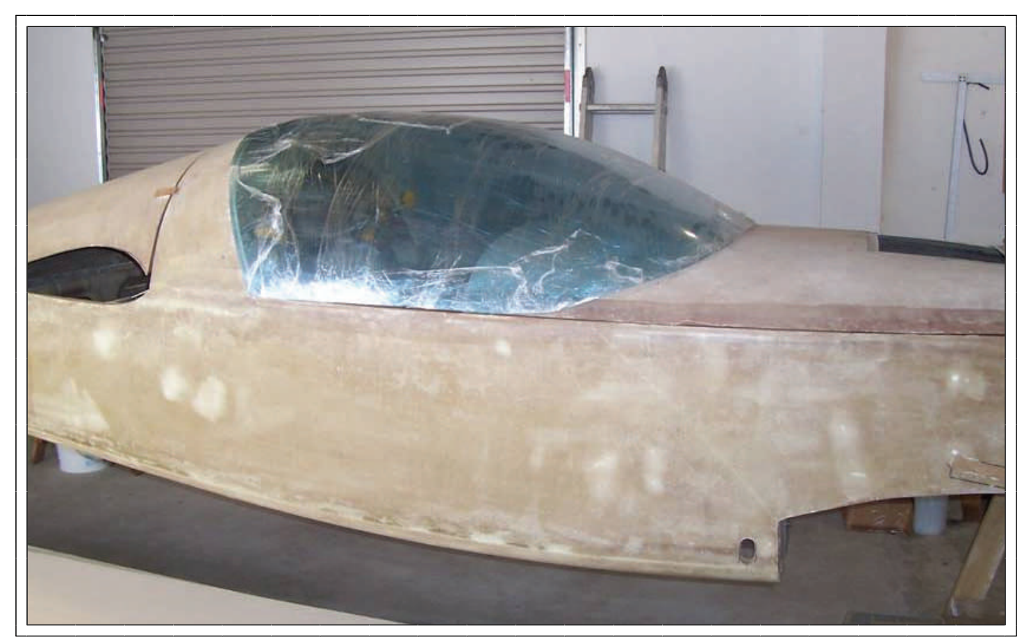
DBFN 119 PAGE 6